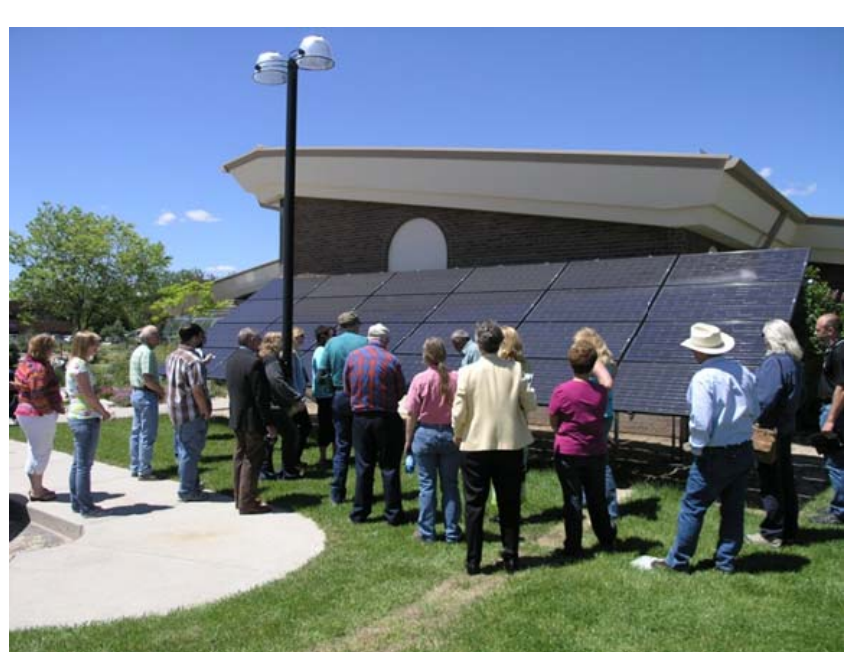
An example of a solar electric system at the Natrona County Cooperative Extension Office.

Education and your community can be quite important to family businesses, and an RE system can be part of your involvement. As many people value the attributes of RE, it may provide positive publicity through noting your products are produced with RE or to simply have a visible system (e.g. wind or solar) on your building. These systems can also be used to educate your community about where their energy originates (hint: it is not the outlet on the wall). In addition, some family businesses are simply fascinated by the ability to produce their own energy. Many systems use intriguing technology to harvest energy, and this can appeal to the technical interest of business owners. Similarly, with excellent wind and solar re-