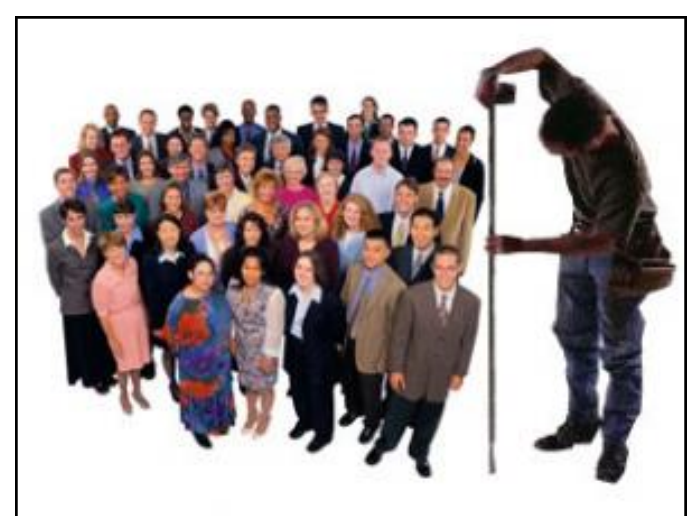
Psychographics is statistical data which defines potential costumer's general attitudes, behaviors, decisions and opinions. In other words, psychographics define and measure lifestyle choices, or describe how people feel or act.

A simple worksheet for collecting information is at the end of this article.