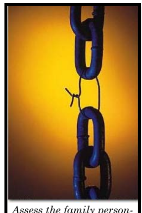
Assess the family personalities, does everyone's role fit them, or is there a weak link evident?

For individuals, such things as personality assessment, leadership styles, willingness to take risks, natural and learned skills and abilities need to be honestly determined and noted. If one person is gregarious and not detail oriented, it would not be wise to expect them to be the bookkeeper just because it was our family tradition. On the other hand, it would not be to our advantage to put the introverted individual in sales.