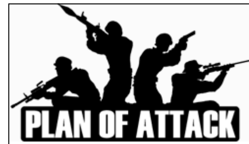
Like a well planned military campaign, family businesses must have a clear understanding of their strengths and weaknesses and a plan of operation.

I liken this need for assessment in the family business (or any business) to the pre-planning process for a military campaign. Before our armed forces could effectively attack and invade Iraq it was necessary for the planners to have a very clear picture of the amount and placement of all personnel and materiel. Not only did this require an understanding of the amount