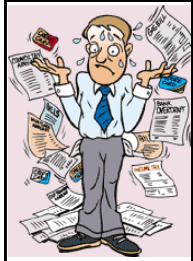
...Credit constraints should play a role in keeping household debt down.

Increased consumer purchasing power has been made more easily available by the credit industry; individuals and families alike are one paycheck away from the brink of financial ruin. People are now paying for things such as groceries, tuition