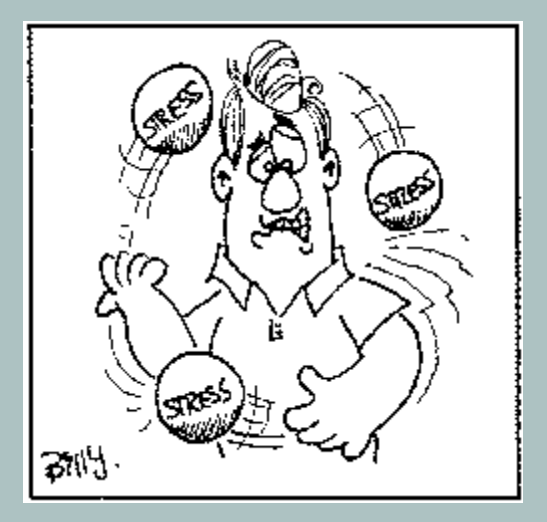
Get a handle on stress. Try to take one thing at a time.