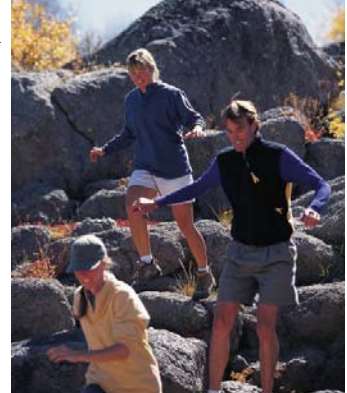
Keep occupied, active and involved.

You may be ready to look at your basic lifestyle and decide to get just as much out of living but without the need to buy, buy, buy. Living a simpler life-