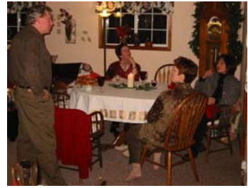
Keep the family updated and involved

One of the first things a family needs to do is to prioritize and decide what things constitute essentials and what are extras. Then a family can budget for important things such as a mortgage, health costs, utilities, and food and delay or eliminate non-essential items.